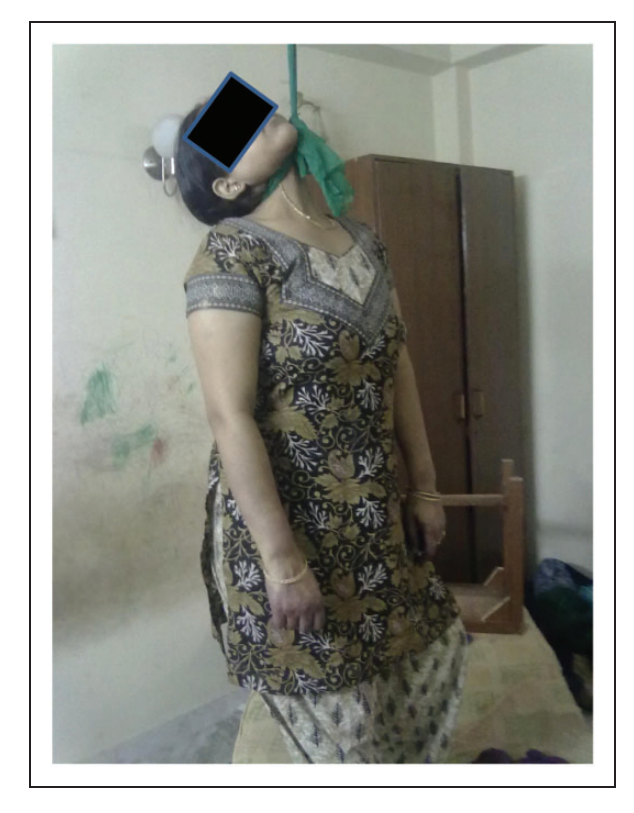
Figure 1. Mother's body hanging from ceiling fan.

chunni (Figure 2). The body of a 2 years male child was found lying in a supine position on the bed in the same room (Figure 3).