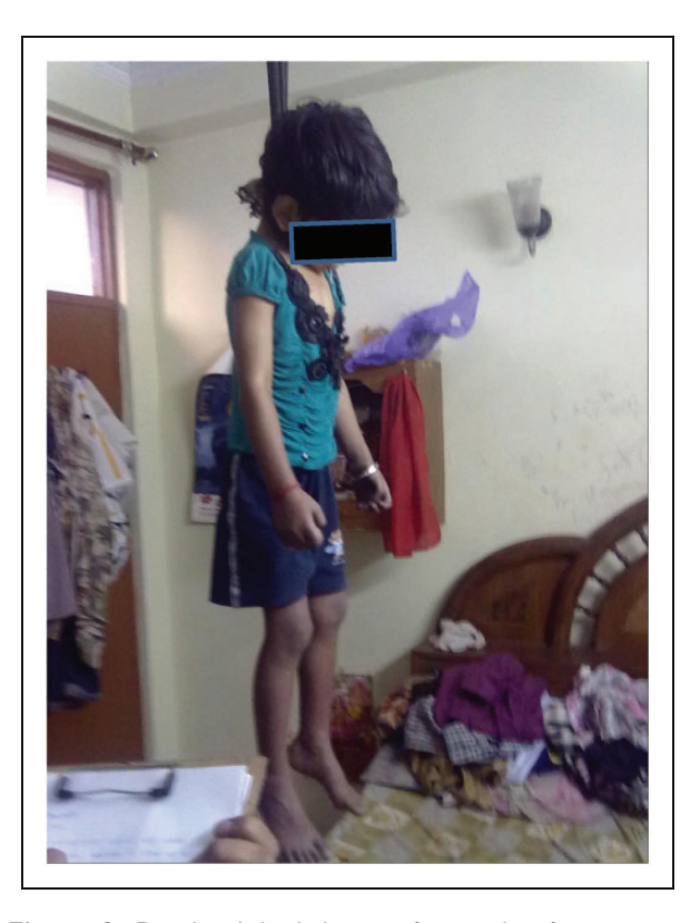
Figure 2. Daughter's body hanging from ceiling fan.

Dried salivary stains were present near right angle of mouth. Palms and finger nails showed bluish discoloration. A black synthetic chunni was present around the neck. On removal of the ligature material, a faint