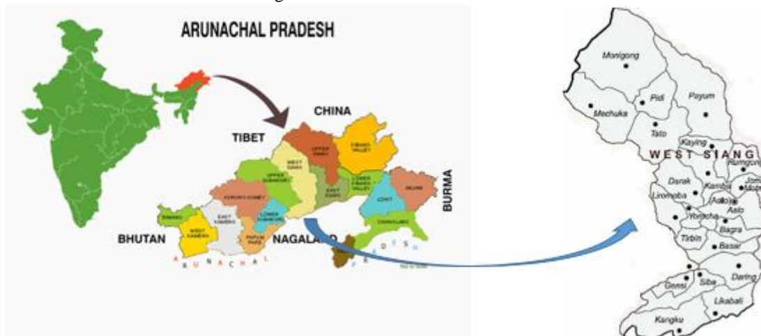
Fig.1 Location map of study area