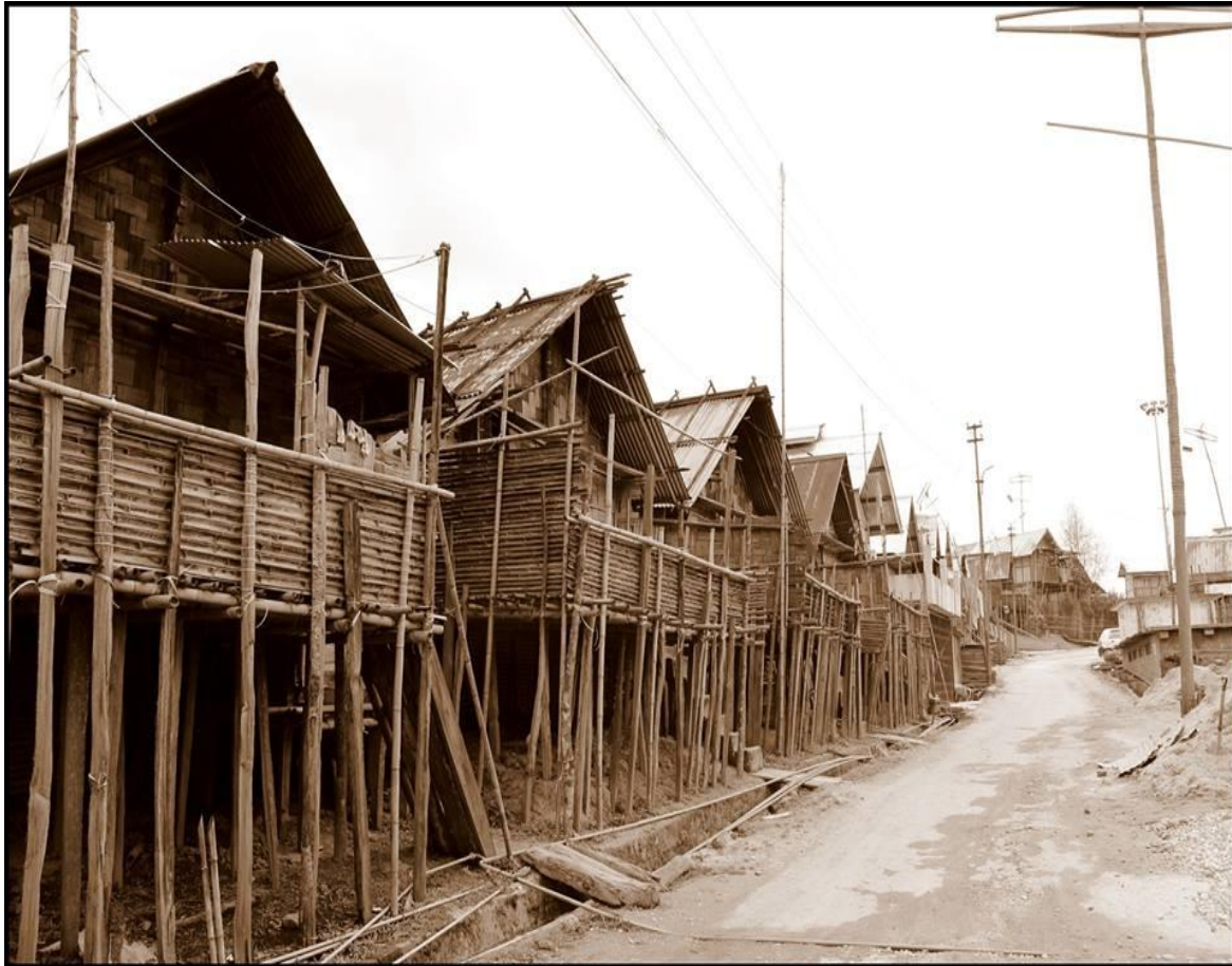
FIGURE 3. NEWLY CONSTRUCTED TRADITIONAL HOUSES OF THE APATANI TRIBE IN ZIRO VALLEY OF ARUNACHAL PRADESH, INDIA. THE SUPPORTING STRUCTURES OF THE TRADITIONAL HOUSES ARE MADE UP OF PINE TIMBER WHILE FLOOR, WALLS AND ROOF ARE CONSTRUCTED OF P. bambusoides

cycling while bamboo groves protect soil from erosion, which corroborates the findings of Rao & Ramakrishnan (1989). The local farmers use pine needles as mulch to reduce weeds. In addition to material uses, bamboos embellish the rural environment and fill the minority people's life with vigor and vitality based on the spiritual value of bamboo in their culture. In the past decade, the bamboos are, however, largely overexploited because of their enormous utility for different purposes besides being used as popular ethnic food.