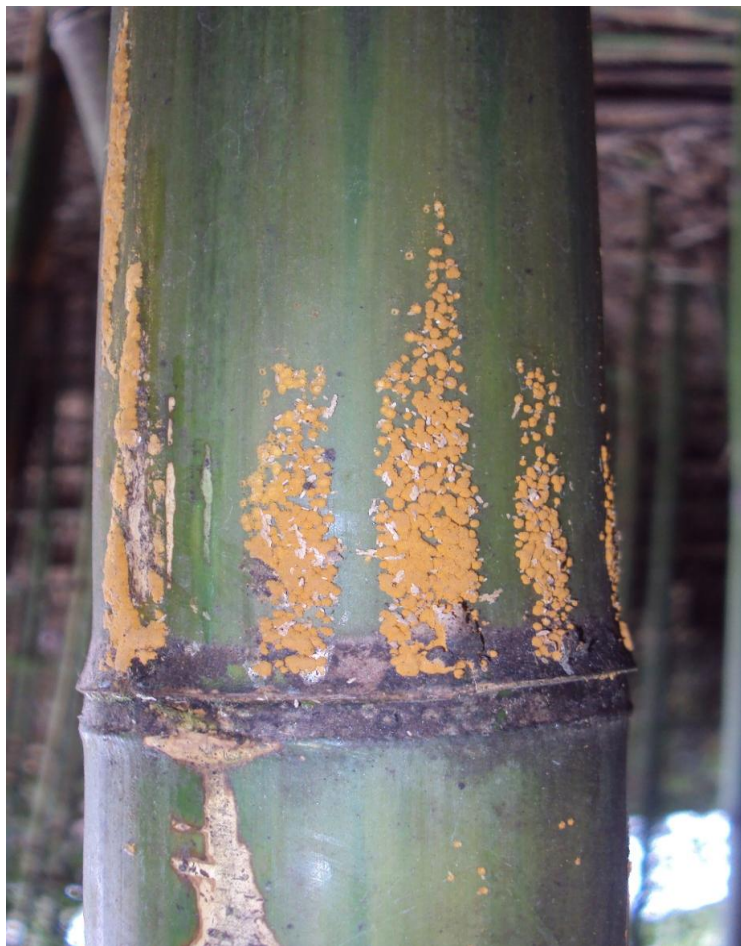
FIGURE 2. MATURE CULM OF P. bambusoides INDICATED BY THE APPEARANCE OF YELLOWISH FUNGUS ( Puccinia sp.) LOCALLY CALLED “ Taipona ”

resin is burned in the evenings to ward off mosquitoes. Ansari et al. (2005) suggested that pine oil showed strong repellent action against Anopheles culicifacies (malaria vector) and Culex quinquefasciatus (pest mosquito). The Apatani tribe also uses the resin for curing cracked heel and also as varnishes. As in many developing regions where medicinal plants are the source of treatment for many diseases and ailments of the poor throughout the developing world (Rao et al. 2004), 50% of the rural villagers in Arunachal Pradesh still depend on medicinal plants – mostly planted in their homegardens – for their medical needs, and pine ranks prominently among such plants.