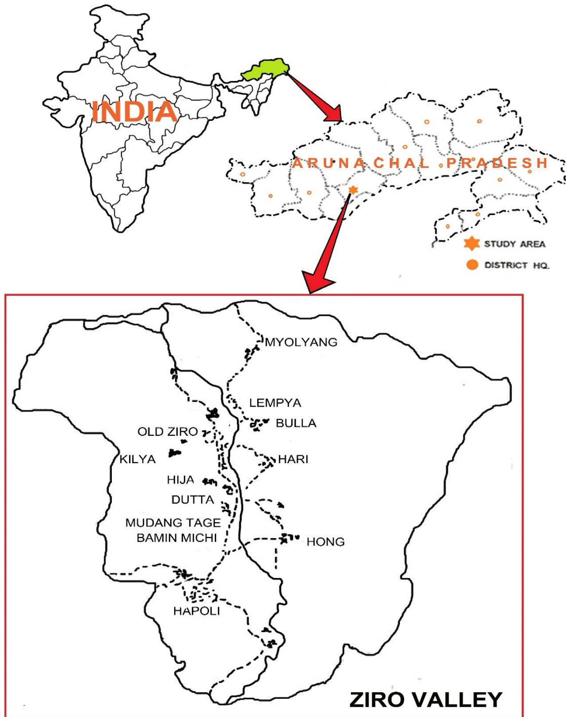
FIGURE 1. MAP SHOWING THE STUDY AREA, ZIRO VALLEY OF ARUNACHAL PRADESH, INDIA