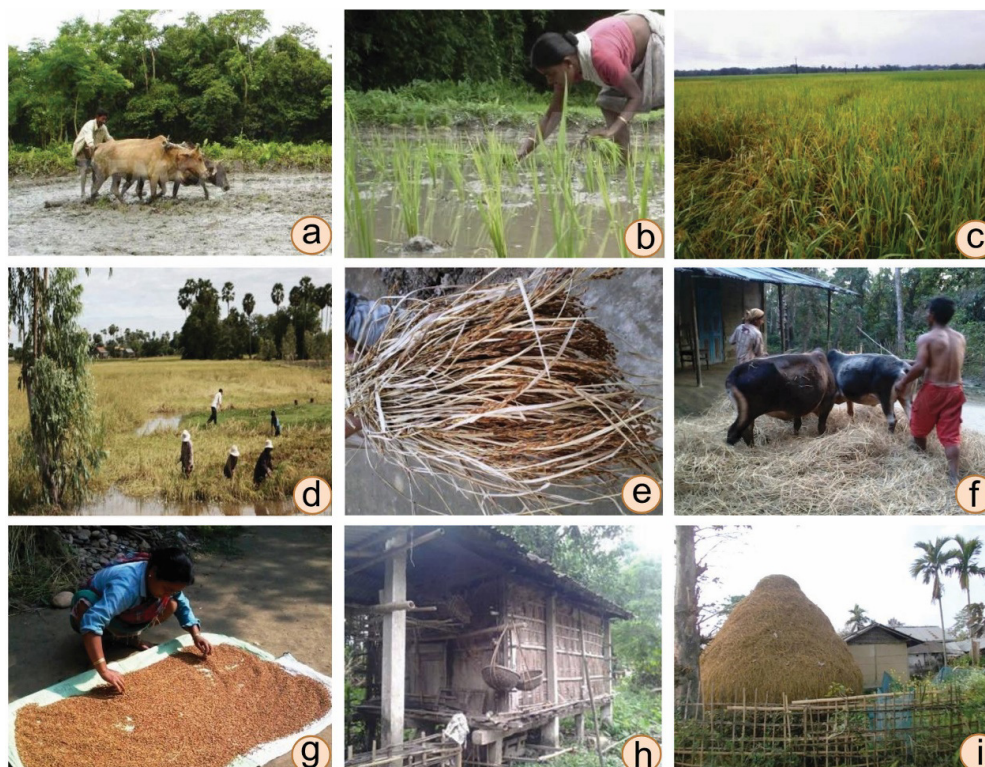
Fig. 3. Phases of Paddy cultivation in Lakhimpur, Assam: a). Preparation of field, b). Transplantation of seedlings, c). Mature paddy field (Sali-dhan), d). Harvesting of Bora-dhan, e). Bunch of harvested paddy, f). Thrashing (Morona), g). sundrying of grains, h) Traditional granary for storage of seeds, i). Pile of straw (fodder for livestock)