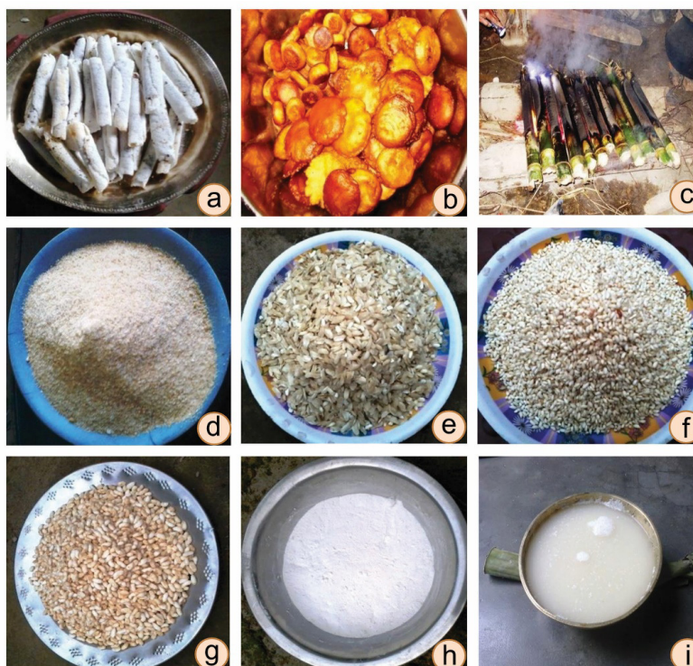
Fig .4. Rice based food and beverages of Lakhimpur, Assam: a. Til pitha, b. Tel pitha, c. Sunga pitha d. Handoh, e. Sira, f. Bora saul, g. Muri, h. Pitha guri, i. Haaz (traditional beer)