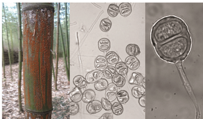
Figure 1. Stereostratum corticioides rust on culms of Phyllostachys bambusoides in Ziro valley and its two celled teliospores.

BLASTN analysis revealed that the sequence had 99% sequence similarity (94% query coverage area) with Stereostratum corticioides . Phylogenetic analysis also clustered the sequence with S. corticioides separating other species into different lineages (Figure 2). This rust was first described by Berkeley and Broome as Puccinia corticioides 9 . Based on sample collected from Japan in 1899, it was later described as Stereostratum corticioides by Magnus 5 . A brief description of this rust fungus was made by Thirumalachar 9 from a 'small fragment of the specimen' received by him from the Natural History Museum, Stockholm.